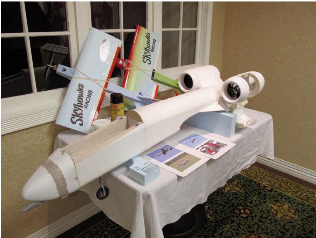
Doug Emerson's A-10 from Wowplanes. 6' wingspan, twin ducted fan partial kit. All up weight will be about 12 pounds.