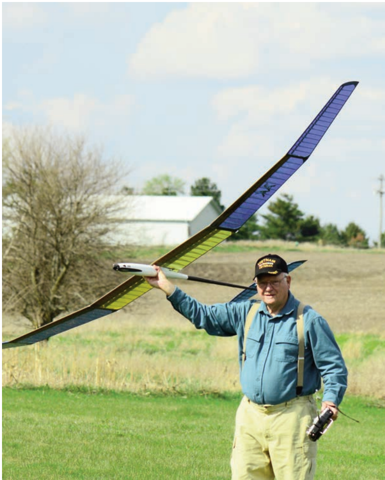
Plenny with Hotliner