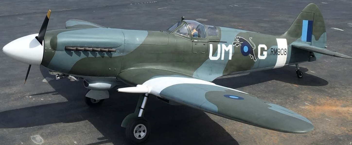
Todd's new Spitfire